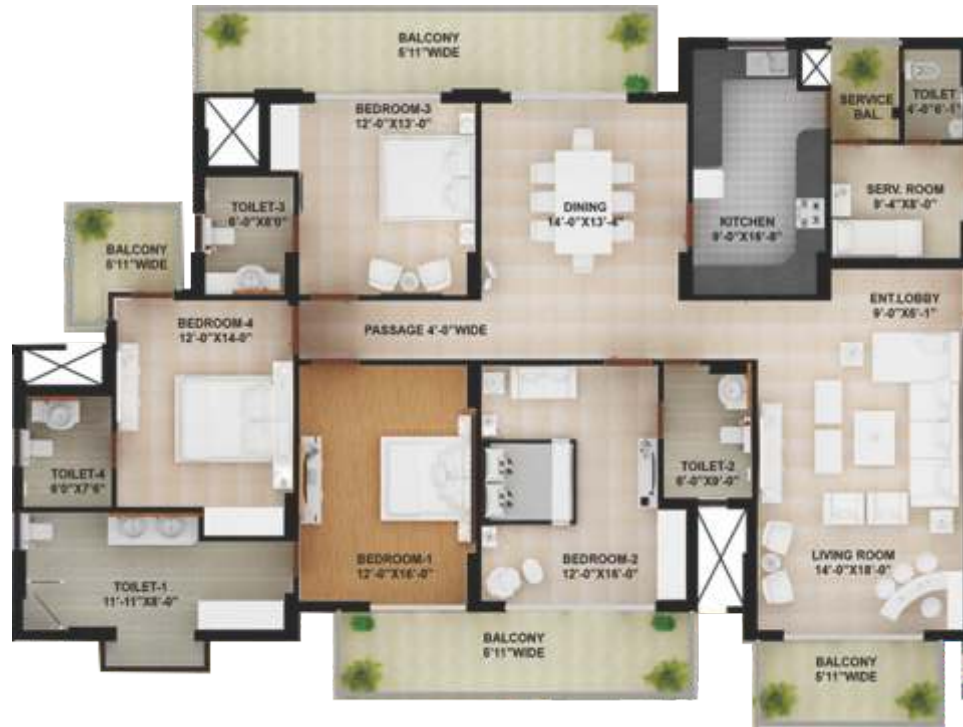
4 BHK Deluxe Apartment Tower : B & C Super Area : 3500 Sq. Ft.