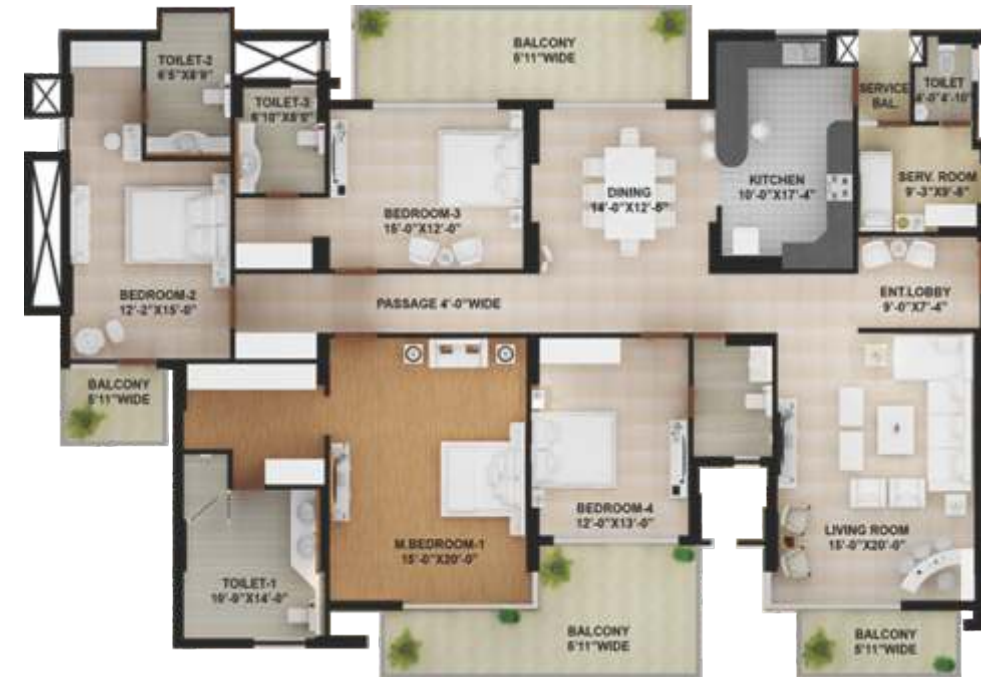
4 BHK Premium Apartment Tower : A Super Area : 4000 Sq. Ft.