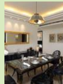
Actual sample flat images