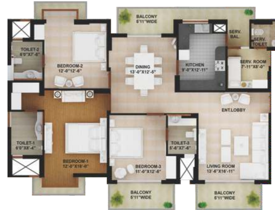
3 BHK Deluxe Apartment Tower : D, E, F, G Super Area : 2390 Sq. Ft.