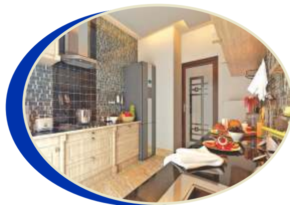
Ultra Luxury Imported Moduler Kitchen