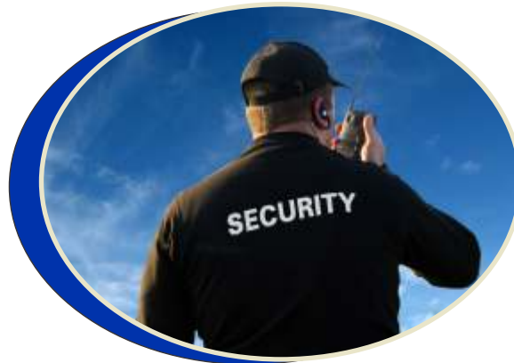
2 Tier Security