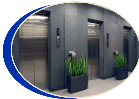
High Speed Elevator