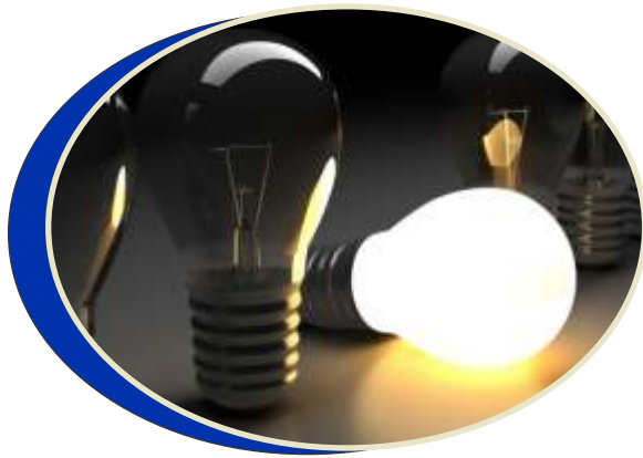
100% Power Backup