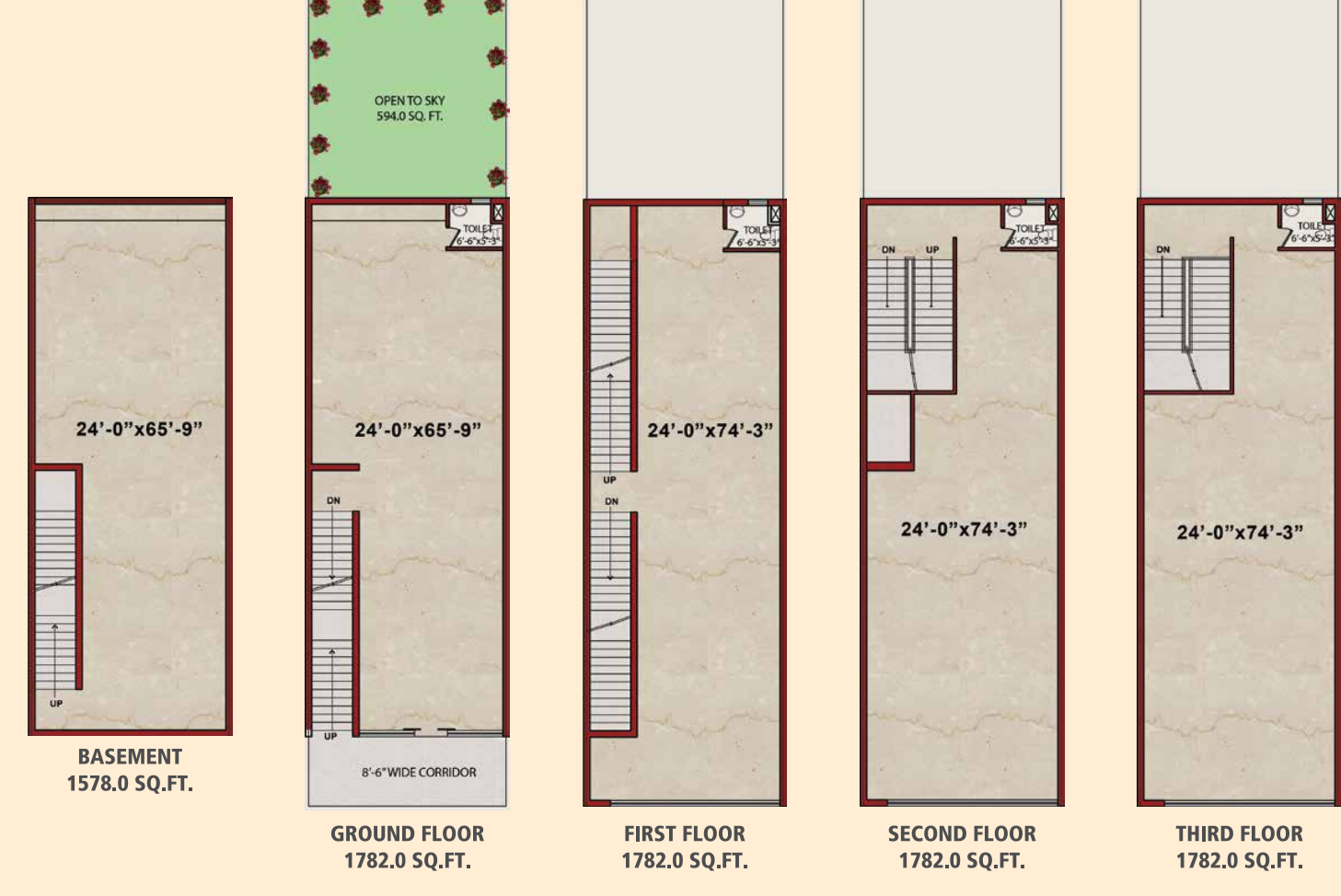
PLOT SIZE = 264 SQ. YDS.