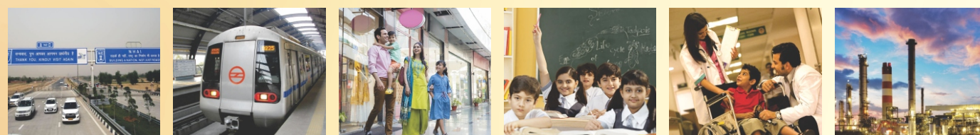
Eastern Peripheral Highway

0 km from Proposed National Highway (12-Lane) / Existing Bypass Road